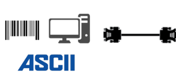
Scanners, Printers, and ASCII Devices

When you call, a live person answers the phone. When you talk with sales, you will get honest answers and recommendations. When you get support, it is from an engineer who had a hand in the product's development, and support doesn't require a ticket or 24-hour wait.