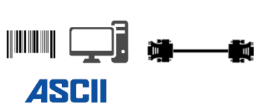
Scanners, Printers, and ASCII Devices

When you call, a live person answers the phone. When you talk with sales, you will get honest answers and recommendations. When you get support, it is from an engineer who had a hand in the product's development, and support doesn't require a ticket or 24-hour wait.