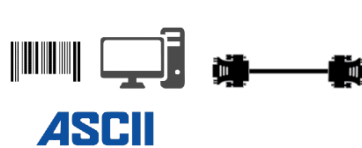
Scanners, Printers, and ASCII Devices

When you call, a live person answers the phone. When you talk with sales, you will get honest answers and recommendations. When you get support, it is from an engineer who had a hand in the product's development, and support doesn't require a ticket or 24-hour wait.