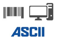
Scanners, Printers, and ASCII Devices

When you call, a live person answers the phone. When you talk with sales, you will get honest answers and recommendations. When you get support, it is from an engineer who had a hand in the product's development, and support doesn't require a ticket or 24-hour wait.