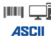
Scanners, Printers, and ASCII Devices

A Solution, A Philosophy, the RTA Way. We understand the long hours spent on a factory floor and the pressure to keep a line running and product flowing. That's how Real Time Automation came to be. You want easy-to-use solutions where the hardest part is to open the box. You need customer support second to none. If you get all that and a fun customer experience all the better. Thirty years later, our mission remains the same: To move your data where you need it, when you need it, and how you need it.