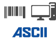
Scanners, Printers, and ASCII Devices

A Solution, A Philosophy, the RTA Way. We understand the long hours spent on a factory floor and the pressure to keep a line running and product flowing. That's how Real Time Automation came to be. You want easy-to-use solutions where the hardest part is to open the box. You need customer support second to none. If you get all that and a fun customer experience all the better. Thirty years later, our mission remains the same: To move your data where you need it, when you need it, and how you need it.