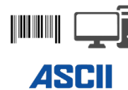
Scanners, Printers, and ASCII Devices

A Solution, A Philosophy, the RTA Way. We understand the long hours spent on a factory floor and the pressure to keep a line running and product flowing. That's how Real Time Automation came to be. You want easy-to-use solutions where the hardest part is to open the box. You need customer support second to none. If you get all that and a fun customer experience all the better. Thirty years later, our mission remains the same: To move your data where you need it, when you need it, and how you need it.