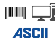
Scanners, Printers, and ASCII Devices

A Solution, A Philosophy, the RTA Way. We understand the long hours spent on a factory floor and the pressure to keep a line running and product flowing. That's how Real Time Automation came to be. You want easy-to-use solutions where the hardest part is to open the box. You need customer support second to none. If you get all that and a fun customer experience all the better. Thirty years later, our mission remains the same: To move your data where you need it, when you need it, and how you need it.