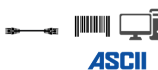
Scanners, Printers, and ASCII Devices

A Solution, A Philosophy, the RTA Way. We understand the long hours spent on a factory floor and the pressure to keep a line running and product flowing. That's how Real Time Automation came to be. You want easy-to-use solutions where the hardest part is to open the box. You need customer support second to none. If you get all that and a fun customer experience all the better. Thirty years later, our mission remains the same: To move your data where you need it, when you need it, and how you need it.