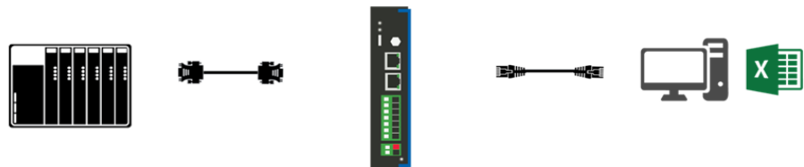
DF1 Slave Devices

When you call, a live person answers the phone. When you talk with sales, you will get honest answers and recommendations. When you get support, it is from an engineer who had a hand in the product's development, and support doesn't require a ticket or 24-hour wait.