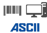
Scanners, Printers, and ASCII Devices

A Solution, A Philosophy, the RTA Way. We understand the long hours spent on a factory floor and the pressure to keep a line running and product flowing. That's how Real Time Automation came to be. You want easy-to-use solutions where the hardest part is to open the box. You need customer support second to none. If you get all that and a fun customer experience all the better. Thirty years later, our mission remains the same: To move your data where you need it, when you need it, and how you need it.