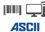
Scanners, Printers, and ASCII Devices

A Solution, A Philosophy, the RTA Way. We understand the long hours spent on a factory floor and the pressure to keep a line running and product flowing. That's how Real Time Automation came to be. You want easy-to-use solutions where the hardest part is to open the box. You need customer support second to none. If you get all that and a fun customer experience all the better. Thirty years later, our mission remains the same: To move your data where you need it, when you need it, and how you need it.