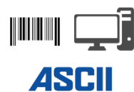
Scanners, Printers, and ASCII Devices

A Solution, A Philosophy, the RTA Way. We understand the long hours spent on a factory floor and the pressure to keep a line running and product flowing. That's how Real Time Automation came to be. You want easy-to-use solutions where the hardest part is to open the box. You need customer support second to none. If you get all that and a fun customer experience all the better. Thirty years later, our mission remains the same: To move your data where you need it, when you need it, and how you need it.