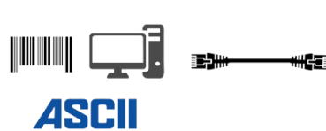
Scanners, Printers, and ASCII Devices

When you call, a live person answers the phone. When you talk with sales, you will get honest answers and recommendations. When you get support, it is from an engineer who had a hand in the product's development, and support doesn't require a ticket or 24-hour wait.