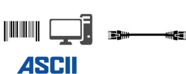
Scanners, Printers, and ASCII Devices

When you call, a live person answers the phone. When you talk with sales, you will get honest answers and recommendations. When you get support, it is from an engineer who had a hand in the product's development, and support doesn't require a ticket or 24-hour wait.