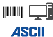
Scanners, Printers, and ASCII Devices

When you call, a live person answers the phone. When you talk with sales, you will get honest answers and recommendations. When you get support, it is from an engineer who had a hand in the product's development, and support doesn't require a ticket or 24-hour wait.