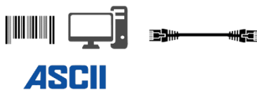
Scanners, Printers, and ASCII Devices

When you call, a live person answers the phone. When you talk with sales, you will get honest answers and recommendations. When you get support, it is from an engineer who had a hand in the product's development, and support doesn't require a ticket or 24-hour wait.