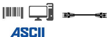
Scanners, Printers, and ASCII Devices

When you call, a live person answers the phone. When you talk with sales, you will get honest answers and recommendations. When you get support, it is from an engineer who had a hand in the product's development, and support doesn't require a ticket or 24-hour wait.