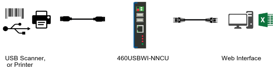
USB Scanner, or Printer

When you call, a live person answers the phone. When you talk with sales, you will get honest answers and recommendations. When you get support, it is from an engineer who had a hand in the product's development, and support doesn't require a ticket or 24-hour wait.